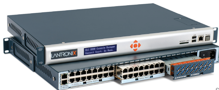
SLC™ 8000 Console Manager

All modern data centers are constructed with a high regard for physical security and efficiency. Nevertheless, there is an ongoing cost to the operation for each visitor entering the site: this expense can be mitigated by using secure remote access solutions from Lantronix providing benefits for data center operators and customers alike. One should consider Lantronix out-of-band Remote Environment Management products in these situations.